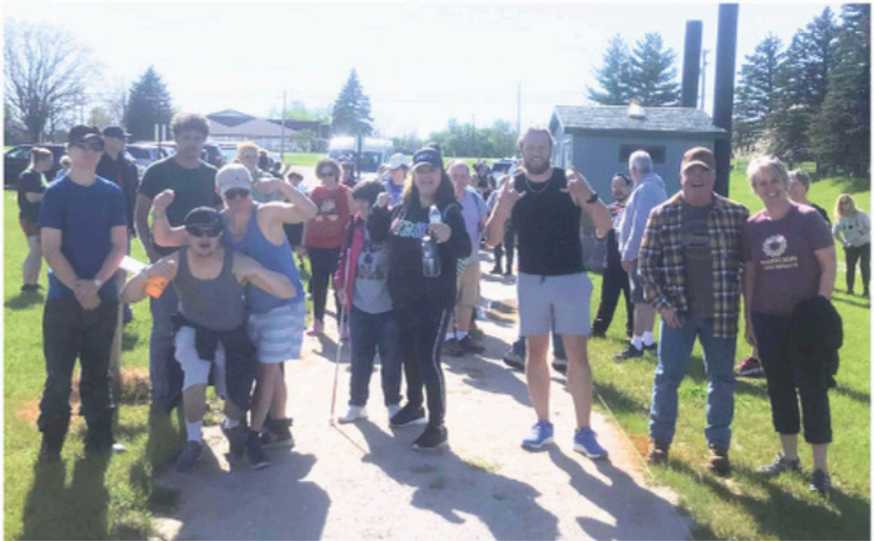
2024 3rd Annual MCN Race to End Stigma 5K and Wellness Walk